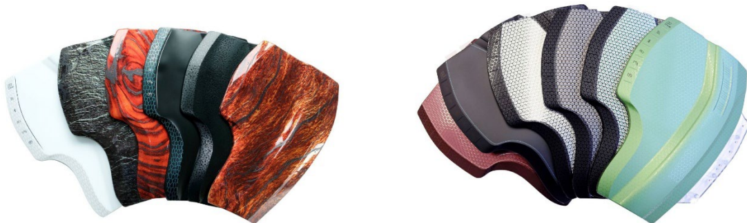
Picture 4-5: Decorative tactile effect, printed with Norilux® DC on a PC film. Second surface decoration including secret-til-lit effect was printed with the IMD/FIM ink system NORIPHAN® HTR N.

Even mobile phone covers and sanitary panels are overprinted with the highly resistant lacquer. Second surface decoration is printed with the IMD/FIM ink system NORIPHAN® HTR N.