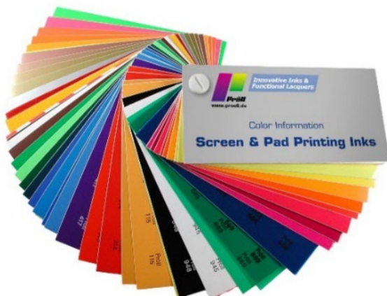
Picture 8: Color swatch – Color Information solvent-based screen & pad printing inks

The ink system is formulated free of cyclohexanone.