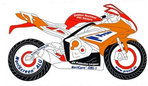
Picture 6: Outdoor-resistant PVC sticker printed with NoriScreen® ALU screen printing inks and protected with NoriCure® ORL-1/001.

The protective lacquer is available as high gloss version NoriCure® ORL-1/001 and as matt version NoriCure® ORL-1/002. The screen printing lacquer shows excellent printing properties, good scratch and abrasion resistance as well as high chemical resistance.