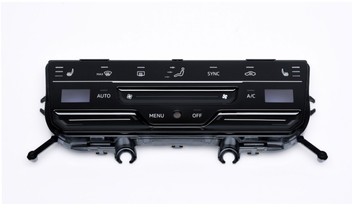
Picture 3: Functional climate control panel, PC hard coat film is partly second surface printed with NORIPHAN® HTR N 959

With the development of the IR transparent NORIPHAN® HTR N 959, a carbon black free, non-conductive black color shade is available for functional touch panel applications. The color shade has a black appearance in incident light. Under transmitted light the color shades appear transparent and is ideally suited for IR & lidar transmitting areas in display and touch panel applications.