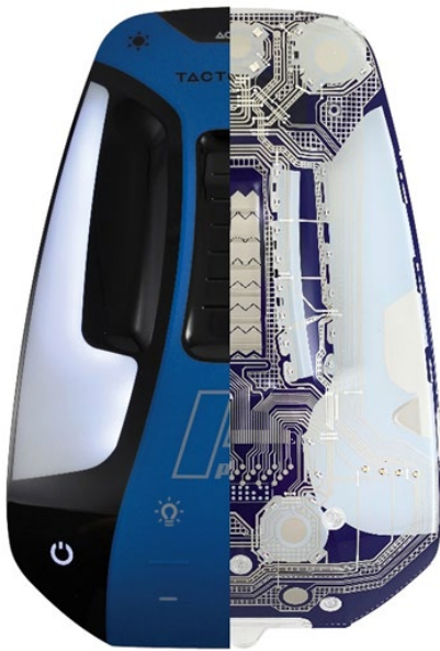
Picture 2: Picture collage - functional IMD/FIM demo part from TactoTek. Non-conductive IMD/FIM ink systems can be used for back printing of the printed conductive pastes.